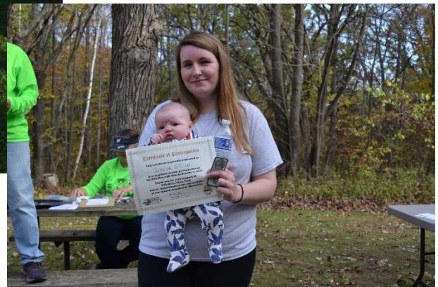
Our youngest racer to date!