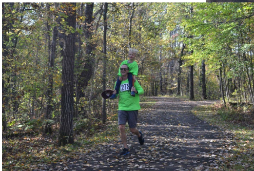
Catching a ride.