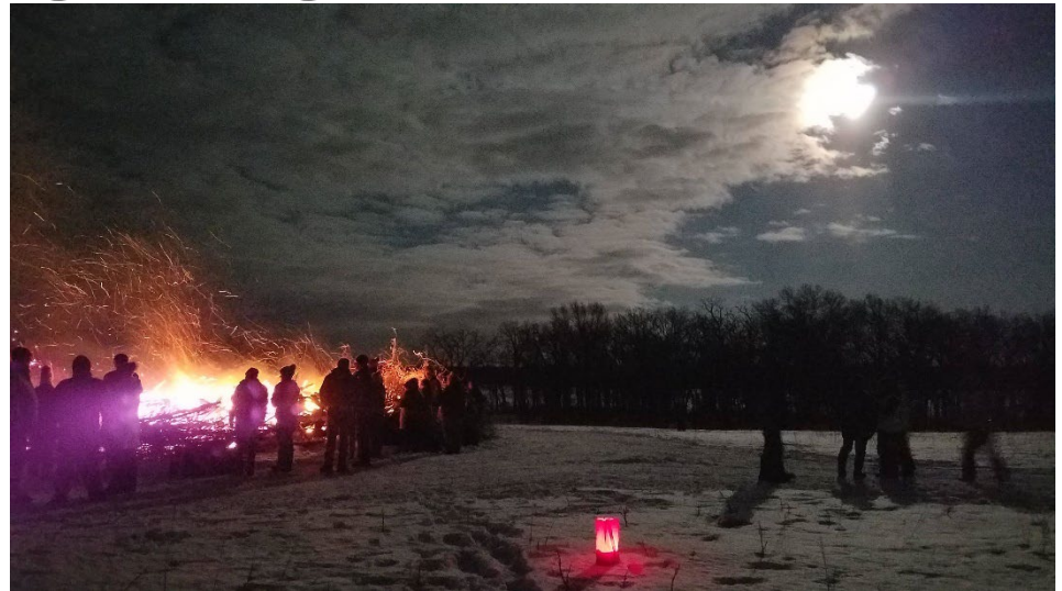
The bonfire and a nearly full moon from the last Candlelight Night in February 2020.

at the park. Call 651-387-4692 in advance to confirm the availability of equipment. An enormous crackling bonfire near the Trail Center will take away the chill. For weather-related event updates, call 651-583-2125 or check visitor