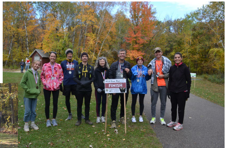
The top finishers of all the age groups.